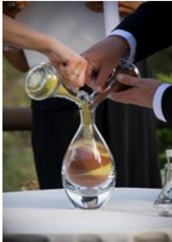
Bride and Groom pour the sands .