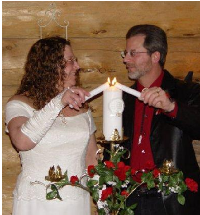
Bride and Groom light Unity Candle.